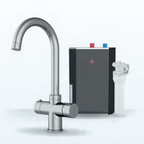
Tap colour : Brushed Nickel DWFK-CALHWT-BN-SWAN