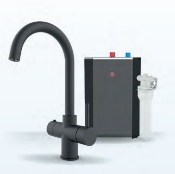
Tap colour : Matt Black DWFK-CALHWT-MB-SWAN