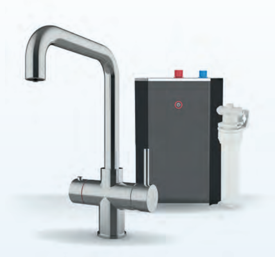
Tap colour : Brushed Nickel DWFK-CALHWT-BN-SQUARE