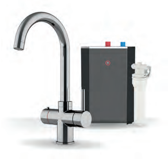
Tap colour : Chrome plated DWFK-CALHWT-CP-SWAN