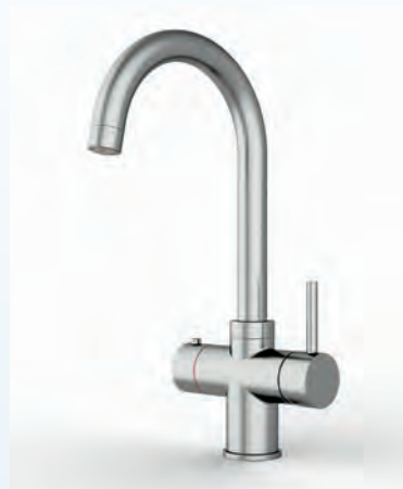
Brushed Nickel - BN