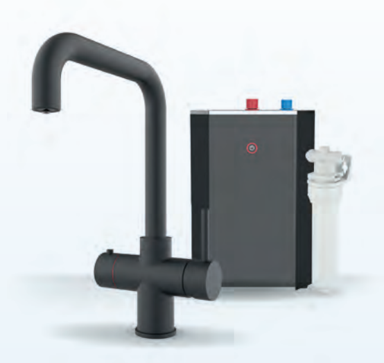
Tap colour : Matt Black DWFK-CALHWT-MB-SQUARE