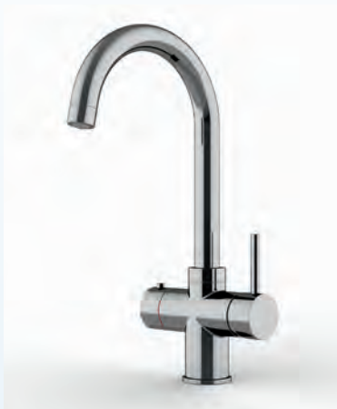
Chrome Plated - CP