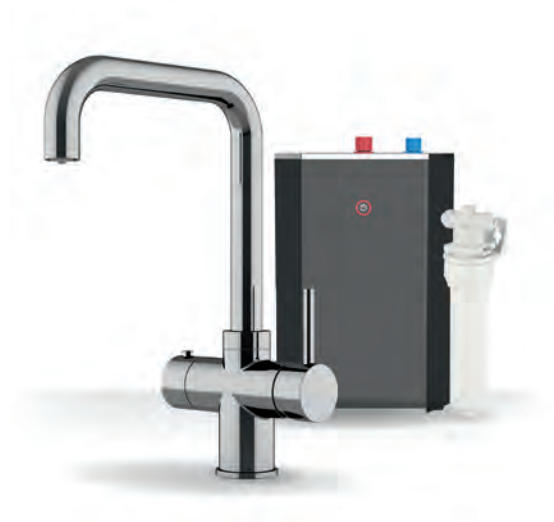
Tap colour : Chrome plated DWFK-CALHWT-CP-SQUARE