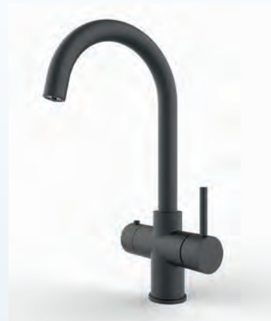
Matt Black - MB

i Each of the colours shown above are available in both Swan & Square tap styles